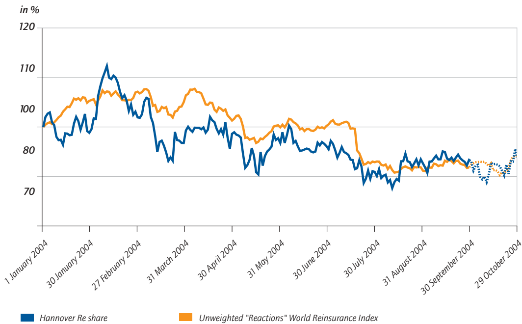
The Hannover Re share in comparison with the unweighted "Reactions" World Reinsurance Index (in USD)

The unweighted "Reactions" World Reinsurance Index combines all listed reinsurers worldwide. Our strategic objective is to achieve an increase in the share price, which on a three-year moving average surpasses the performance of this benchmark.